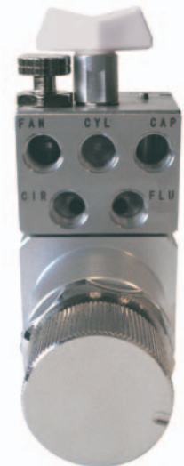
rear side view of manifold